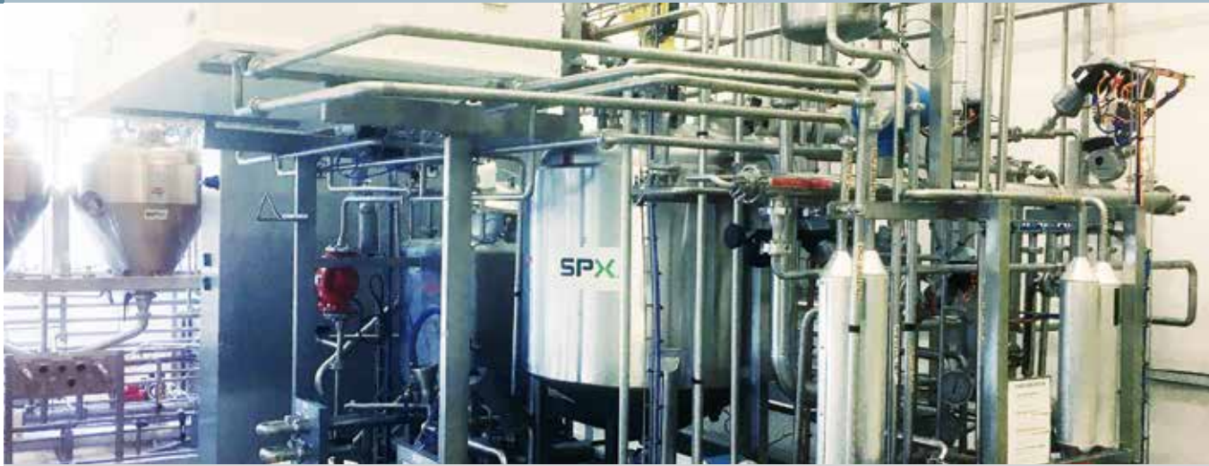
Fresh Dairy Pilot Plant, SPX FLOW Innovation Center, France